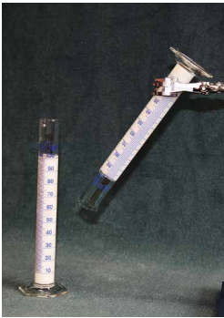
Honeywell flux product characteristics.

In response to customer requests for innovative flux technology to improve safety, enhance process robustness and add value, Honeywell developed a pre-dispersed flux concentrate. Handling of powdered flux is eliminated to promoting a clean and safe manufacturing environment. The Honeywell flux concentrate (Al-Flux 2805 600) is easily diluted with deionised water to create a dispersion of discrete flux particles with a low sedimentation rate suitable for dip or spray application. The unique properties of the Honeywell flux concentrate enable further innovation and refinement of spray application systems, thereby enhancing deposition accuracy, reducing flux overspray, improving material utilization, increasing brazing quality, and ensuring overall cost saving.