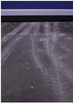
Flux powder dust scattered across the floor of a brazing area at a customer site.